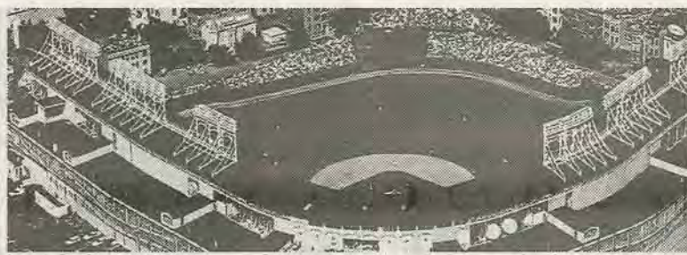
A REAL GEM: Every baseball fan should visit Chicago's Wrigley Field.

Of course, these are the choices in the immediate area. A short taxi or train ride away is Chicago's venerable Michigan Avenue, where the majority of the city's tourist hotels and restaurants are concentrated. You can comfortably extend your Wrigley visit into a long weekend or more.