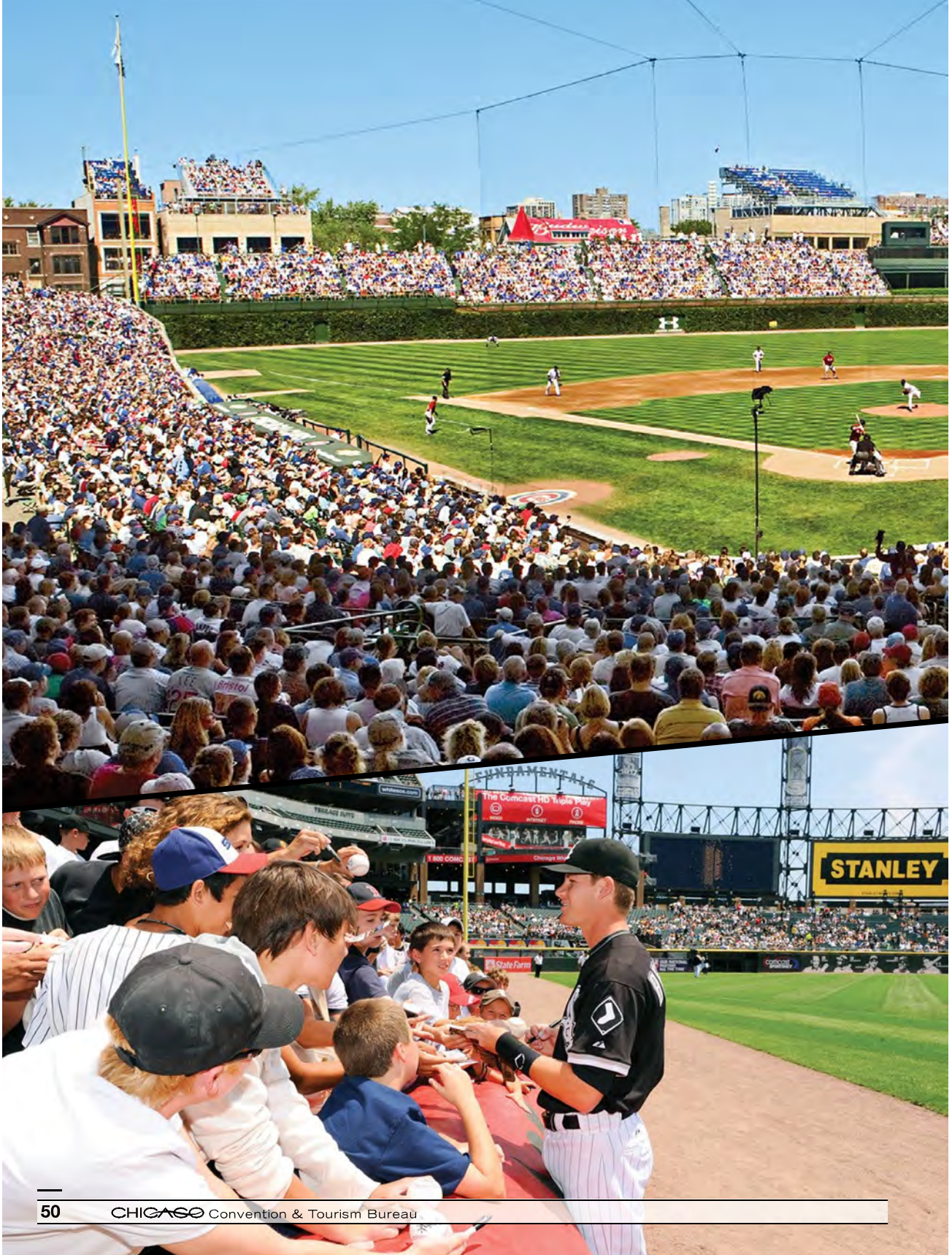
Top: The Cubs play defense at Wrigley Field. Bottom: A White Sox player signs autographs for fans.