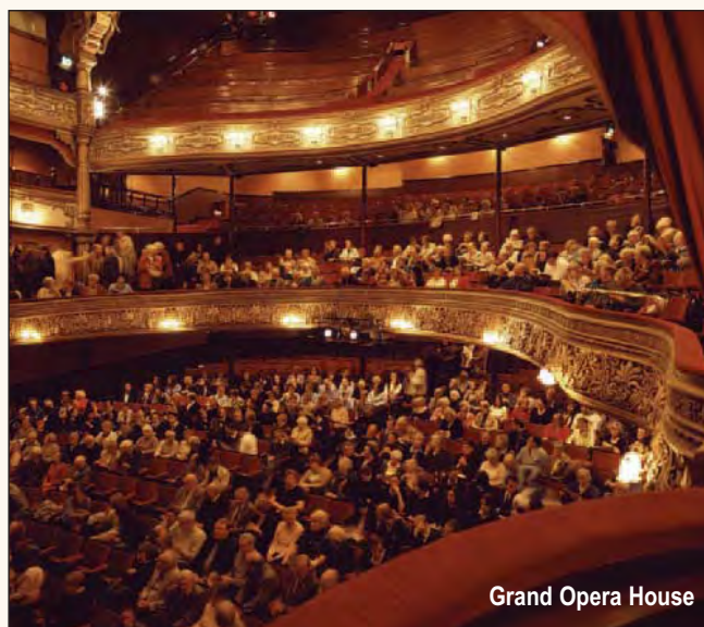
Grand Opera House

One of Ireland’s greatest assets for travel planning professionals is the diverse interests that it accommodates. Here are just a few suggestions: