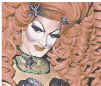
In May, Life Ball turns City Hall into a dance floor that hosts Europe's biggest AIDS charity event, including a Red Ribbon catwalk on City Hall Square.

works by Dali, Degas, Duchamp, Gauguin, and Picasso, among others. Open daily 10 a.m.-7 p.m., Friday until 9 p.m.