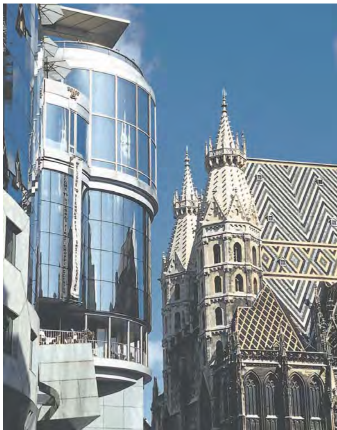
Vienna old and new: St. Stephen's Cathedral (right) Austria's most eminent Gothic edifice, houses a wealth of art treasures. The modern Haas Haus (left) accommodates shops, a top hotel and restaurant as well as a stylish bar.

Eroticism in modern art is on display at Vienna's BA-CA Kunstforum museum ( kunstforumwien.at ) through July 22. Works by nearly three dozen artists from the 19th and 20th Centuries, the exhibit explores sensuality, physical love, seduction, temptation and desire. You'll find