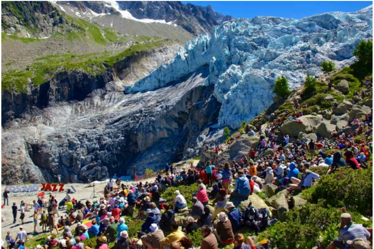
The Cosmo Jazz Festival attracts visitors from around the world, who enjoy eight days of music set amidst the most dramatic alpine scenery in Europe.

With its glass floor, the attraction allows visitors to peer over a 3,200-foot precipice.