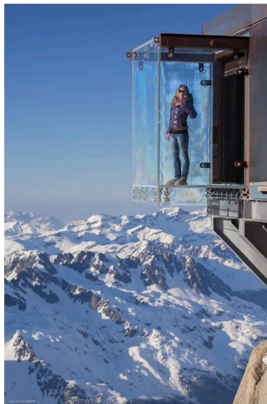
With its glass floor, Step Into the Void allows visitors to peer over a 3,200-foot precipice from Aiguille du Midi.

Resist the temptation to squeeze in Chamonix as part of a whirlwind France vacation; the town is fully deserving of four days minimum to experience the Alps and area attractions. It's welcoming and accessible – no matter your abilities or credit card limit.