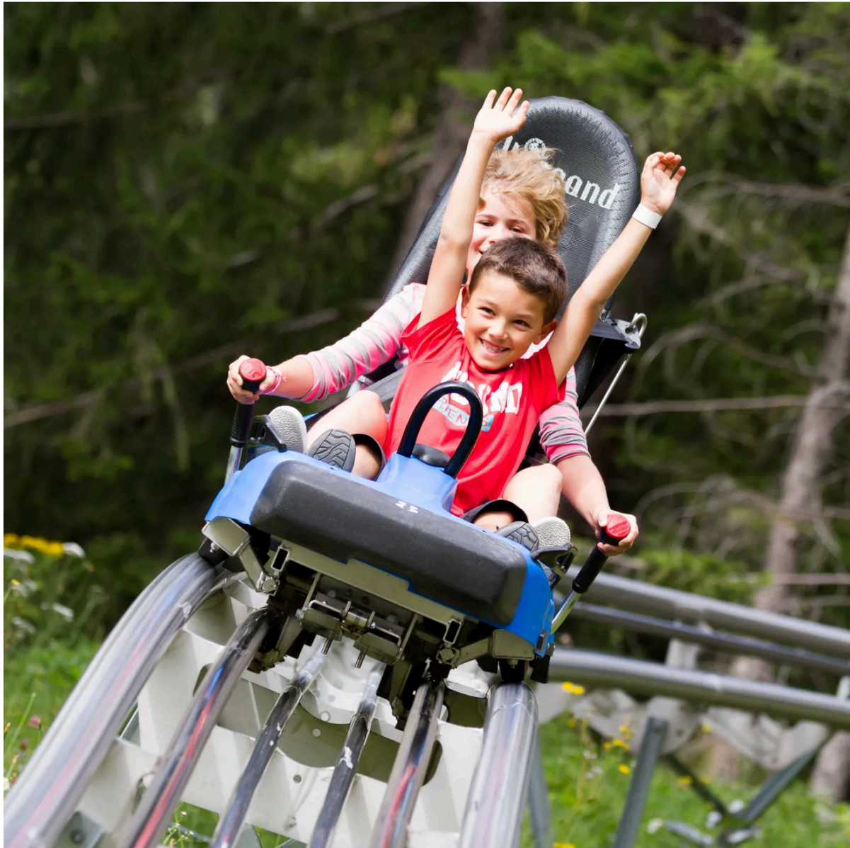
Luge: It's not just for Winter Olympians in spandex.

Despite world-class hiking, rock climbing, skiing, ice climbing, mountain biking, electric biking, paragliding, whitewater rafting, high-end shopping and even summer luge-ing (!), there's a quiet confidence and humility in Chamonix that make everyone feel welcome here, freeing them on an uninhibited pursuit of their bucket list of active experiences.