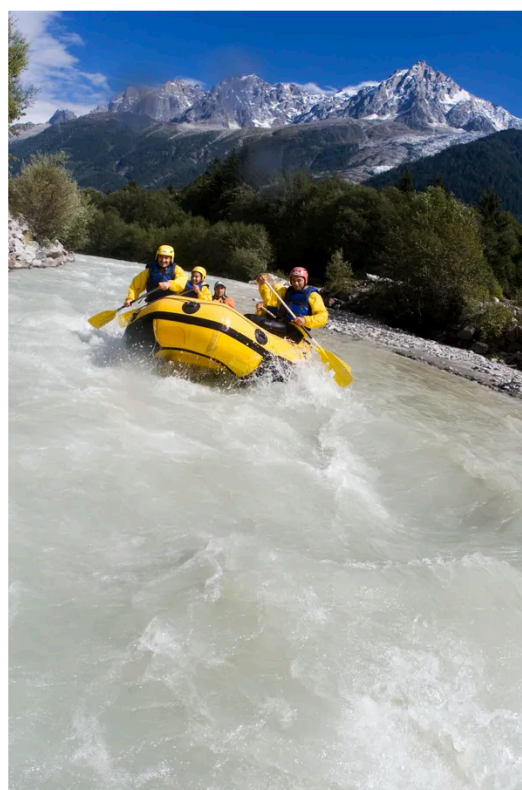
Rafting: Glacial melt delivers a thrilling whitewater rafting experience along the Arve River, with excursions